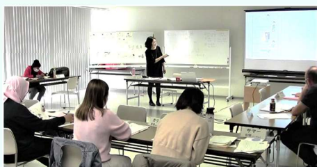
Qualified Japanese language teacher!