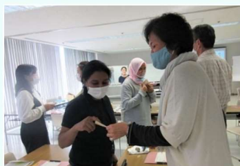
Practice with volunteer classroom assistants!