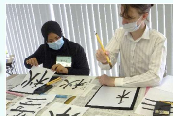
Experience Japanese culture while having fun!